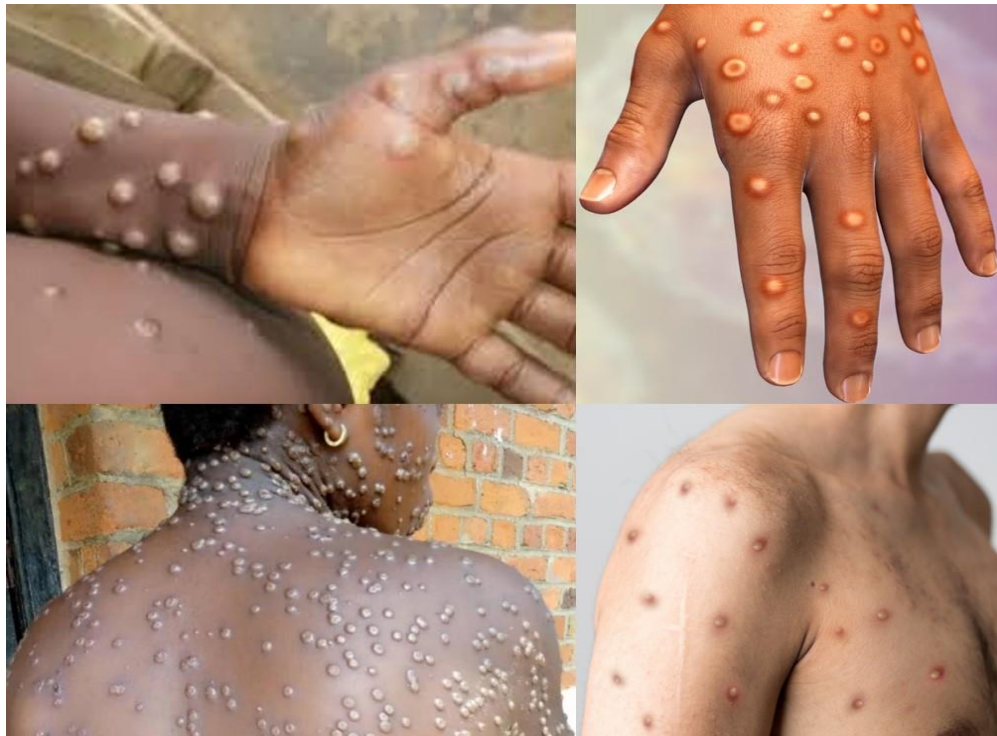
Fig. 2. Different stages of mpox in different regions of the human body.

2. The blisters go through multiple stages before becoming crusty, scabbing over, and falling off (Fig. 3). Rarely, mpox can result in death.