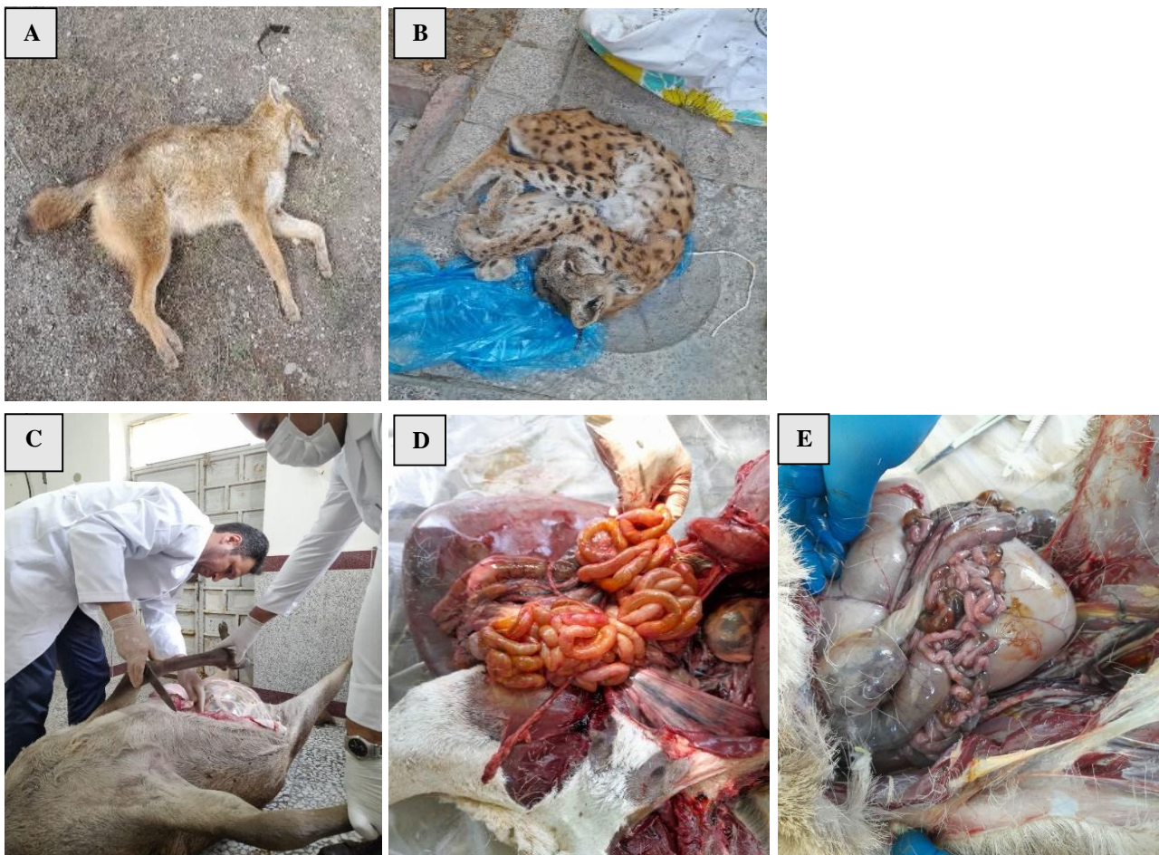
Fig. 1. A: A common fox that died in a road accident. B: Losses of Eurasian lynx due to conflict. C, D, and E: Mesenteric lymph nodes and liver tissue were collected from intermediate hosts.

the investigation and observation of these parasites. In addition, this approach facilitates the visualization of both the right and left nasal cavities and allows the detection of any lingual parasites. For better diagnosis, the samples were referred to the laboratory and they were washed with a gentle stream of water and a 300 sieve. For herbivores, the liver and mesenteric lymph nodes were harvested postmortem and subsequently immersed in lukewarm water following a transverse incision. The lukewarm water relaxes the parasite and the use of a revision loop increases readability while preserving the essential details of the original text (Figures 1 and 2).