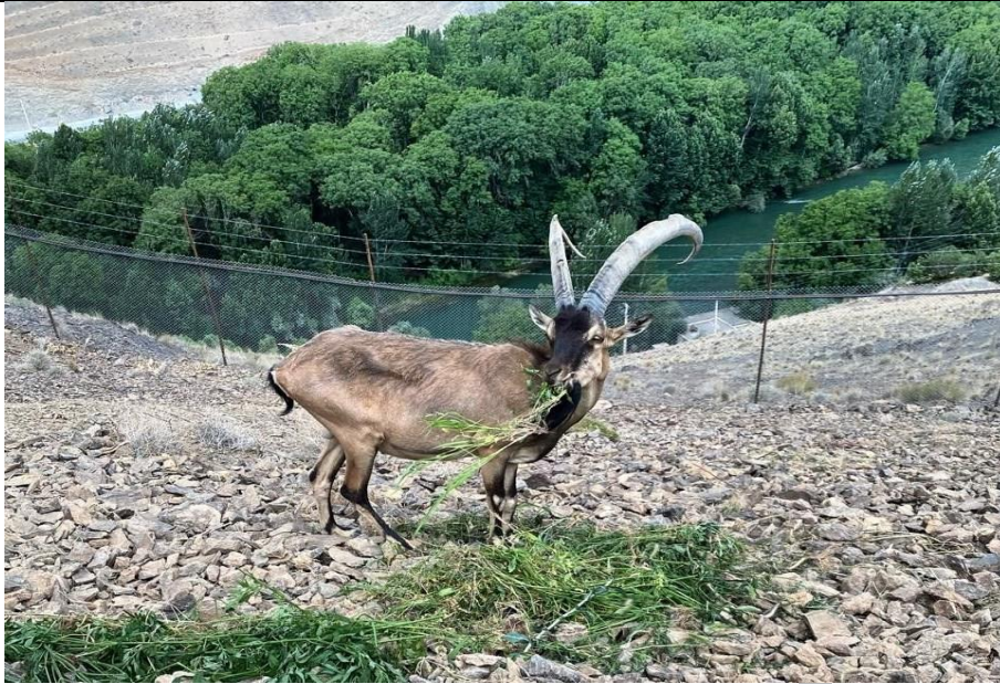
Fig. 1. The wild goat ( Capra aegagrus ) in the wildlife breeding center (Chaharmahal and Bakhtiari province, Iran).