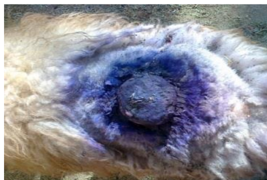
Fig.1. The tumor-like mass with a rough surface on the back of the affected sheep.

A six-years-old native ewe with major clinical signs, including nasal discharge, enlarged superficial lymph nodes, and anorexia, was referred to a veterinary clinic in Najafabad, Isfahan province, Iran. Also, there was a round tumor-like mass about 23.2 cm × 3.5 cm in diameter on the back area (Figure 1). The mass was alopecic, and its surface was rough. At the first step, the mass was removed, but after two weeks, it was appeared again. A sample from the tissue formed on the back of ewe was isolated and placed in 10% formalin and 37% paraffin and then was stained with hematoxylin and eosin (H&E) for histopathological examination.